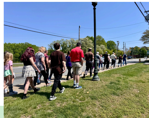
Good Friday Cross Walk