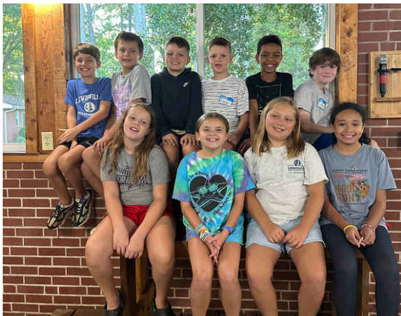
Tween Retreat at Camp Merriwood