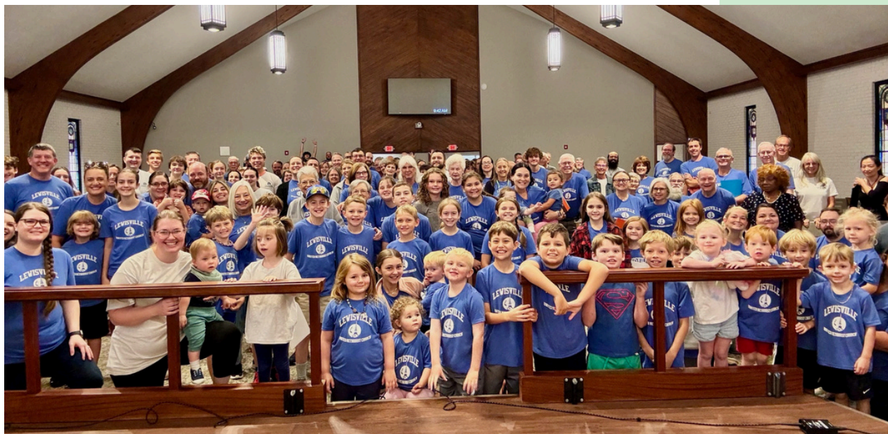
Servant Day 2024