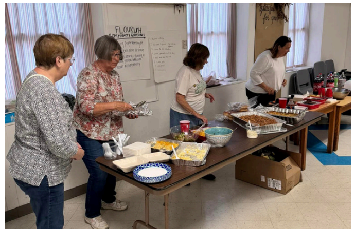
Serving a Meal for Flourish at Green Street UMC