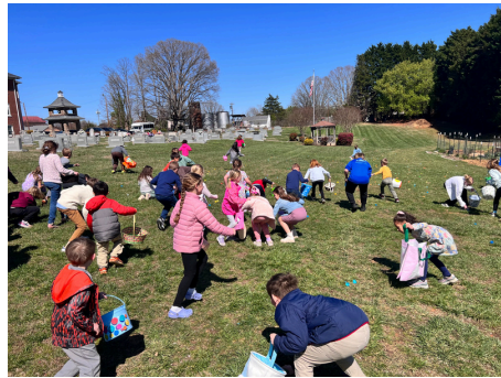
Easter Egg Hunt