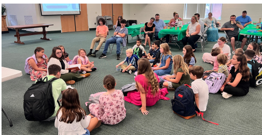
Back to School Blessing