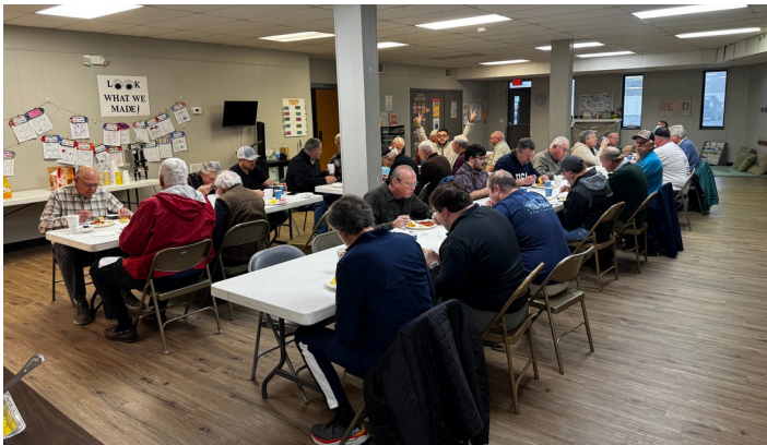
United Methodist Men Breakfast